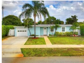
4330 NE 18th Avenue

MLS#: F10057075 Status: CS Price: $200,000 SqFt: Beds: 3 Bath: 1 (1 0)