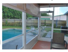
4121 NE 2nd Way

MLS#: R10325350 Status: CS Price: $200,000 SqFt: 1,297 Beds: 3 Bath: 1 (1 0)